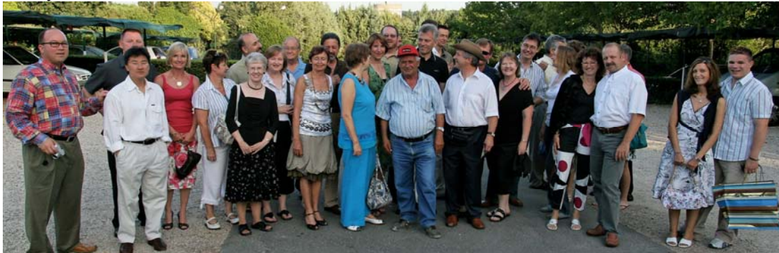
Roundtable Members gather for a Fantastic Dinner in Rome, Italy (6-2007)

Ten years ago a group of people from many different lands came together to form an international fellowship. We will never forget the fun times we had in Arlington, Paris, Las Vegas and Rome. Over the years our group has magically transformed from people who used to get together at Humperdink's for an occasional gathering into a close-knit international family.